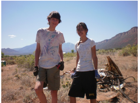
"Plork" (play+work) projects planting trees, cooking dinner, adobe plaster, and cleaning old debris