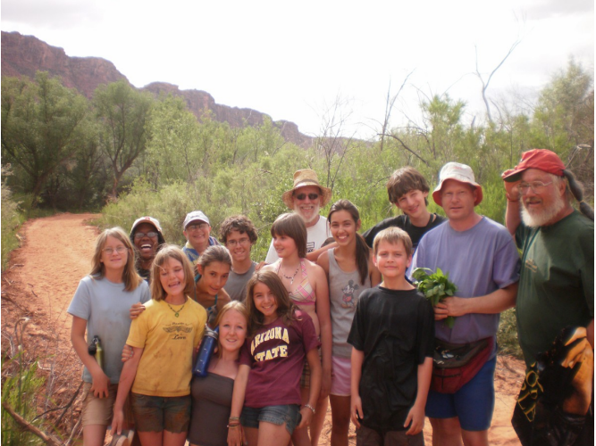
Happy campers and staff at MFC 2011

In 2012 we will be raising the camper fee from $150 per week to $300 to help meet costs. But we don't want cost to be a barrier to camp participation, so we will also increase the amount set aside for "camperships." Even so, we're concerned that asking a relatively small group of families